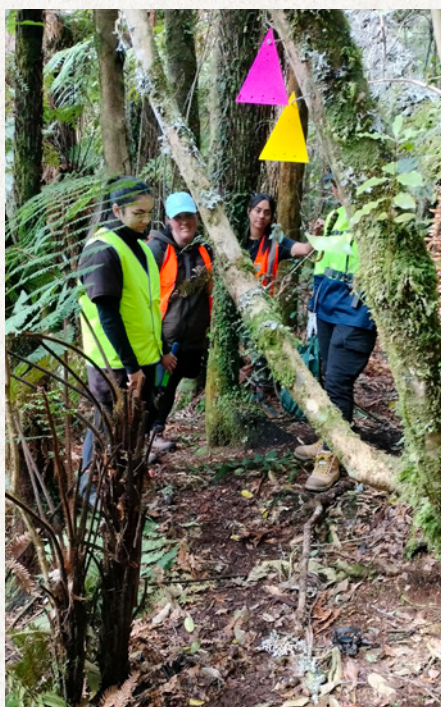
Land Based Training students taken at the end of our 1km line, Pukepoto Maunga, Whakapoungakau Range